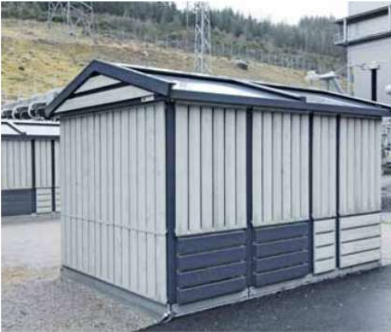
ABB Magnum 300